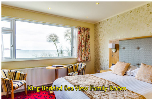
King Bedded Sea View Family Room

We now offer a variety of accommodation including King bedded Double Rooms, Family Rooms, Sea View Rooms, Rooms with Balconies, Family Suites (incorporating two or three bedrooms), a Compact Double Room, and one especially spacious Ground Floor Suite.