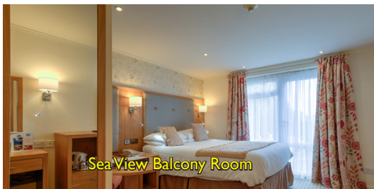
Sea View Balcony Room