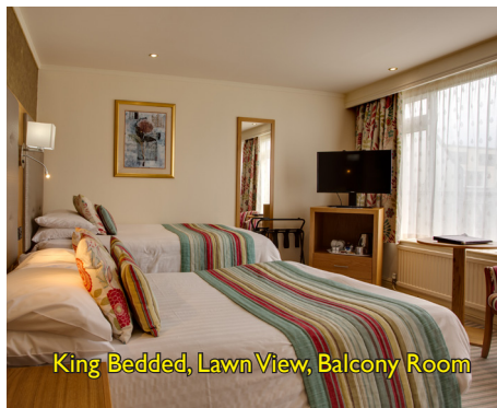
King Bedded, Lawn View, Balcony Room