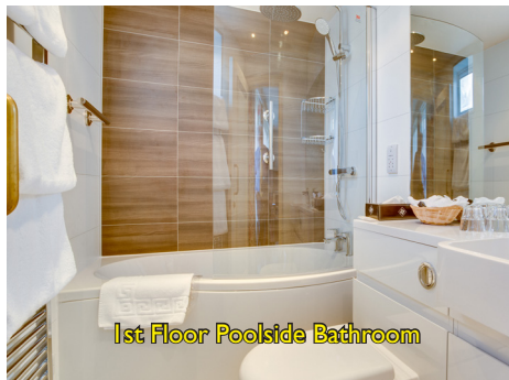
1st Floor Poolside Bathroom