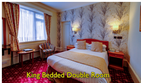
King Bedded Double Room

Our rooms are constantly being updated to maintain today's standards of comfort and convenience and are all tastefully decorated with colour co-ordinated furnishings and fabrics.*