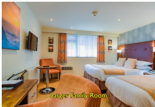
Larger Family Room