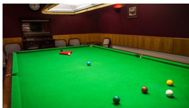
Table Tennis and Tennis are free of charge for hotel residents. The full size snooker table costs £2.00 to hire for 30 minutes and equipment is available to borrow from Reception (over 16's only)