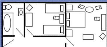
Sketch Plan of a Family suite (Not to scale)

of Balcony Rooms, Family Rooms, or Family Suites.