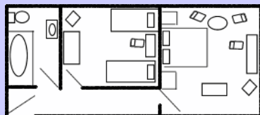
Sketch Plan of a Family suite (Not to scale)

These consist of at least two bedrooms (room 19 has 3) and one private bathroom leading from a small private lobby.