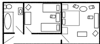
Sketch Plan of a Family suite (Not to scale)

two bedrooms (room 19 has 3) and one private bathroom leading from a small private lobby.