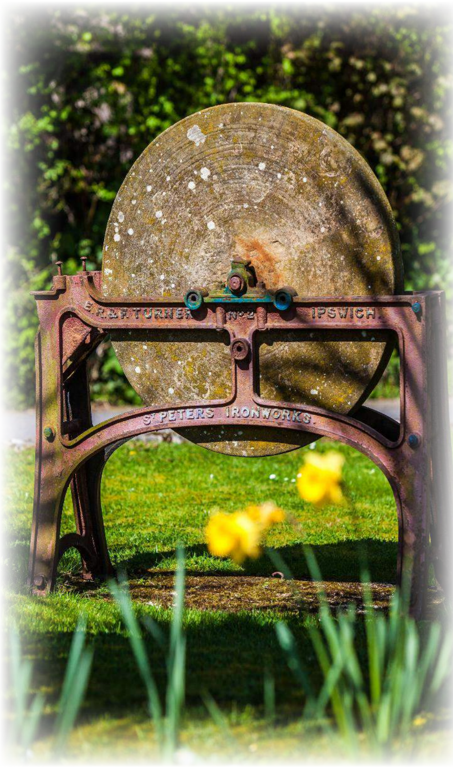
The blacksmith's sharpening wheel in the grounds at Langstone Cliff Hotel