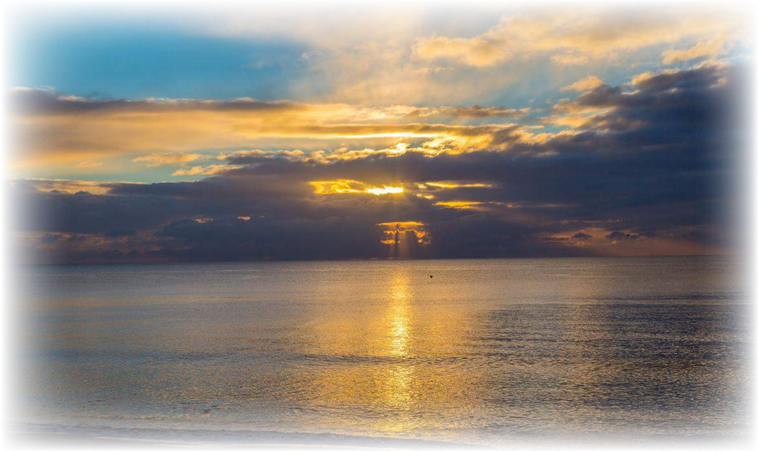
The sun rising over the sea from the sea wall near Langstone Rock.